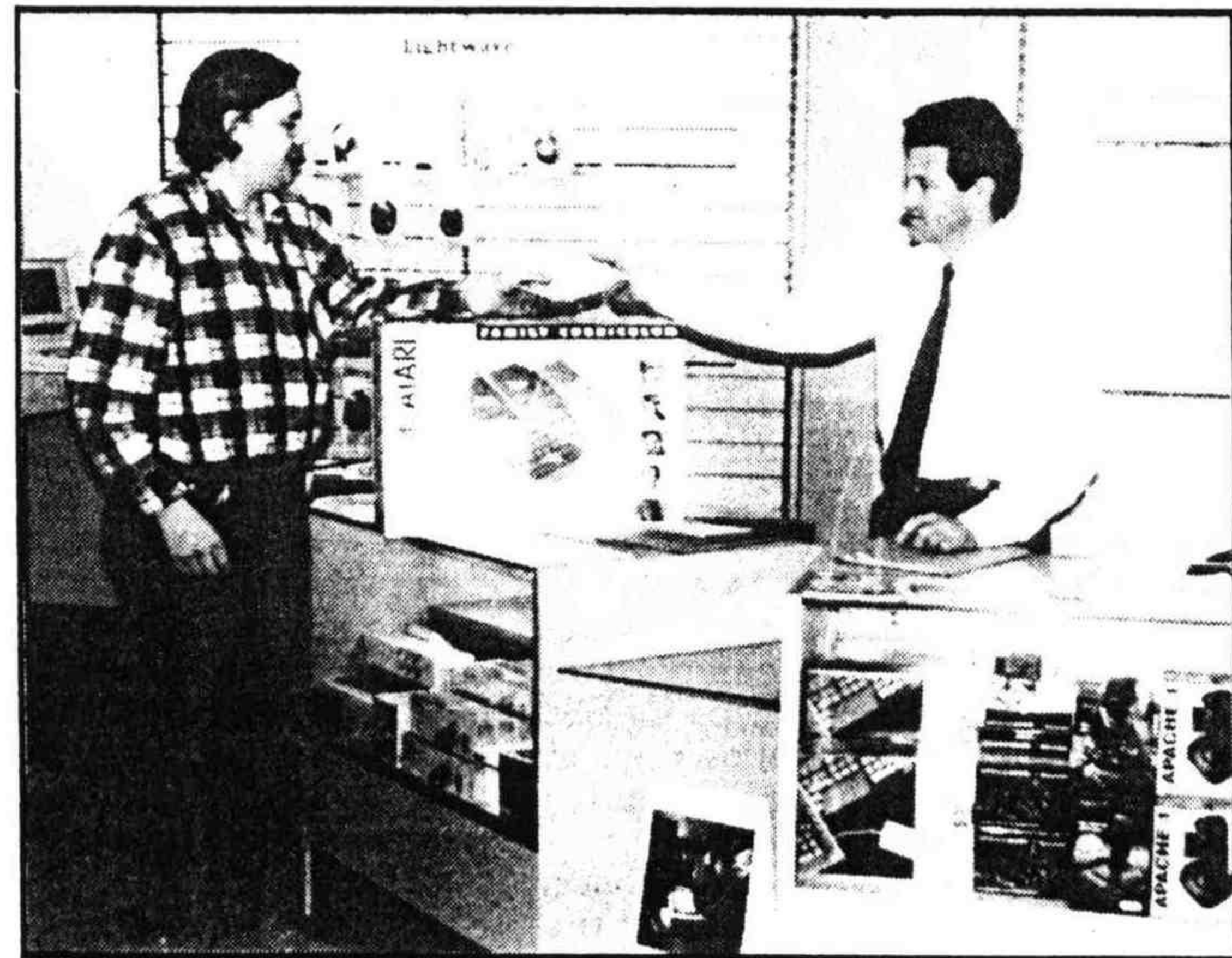
The shop stocks a wide range of equipment for business and entertainment use.

It is the firm intention of the three young entrepreneurs to offer a wider range of computer related services than any other computer business in town.